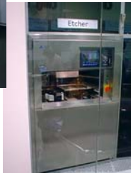
Manufacturing & Industrial