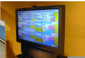
Displays & Exhibits